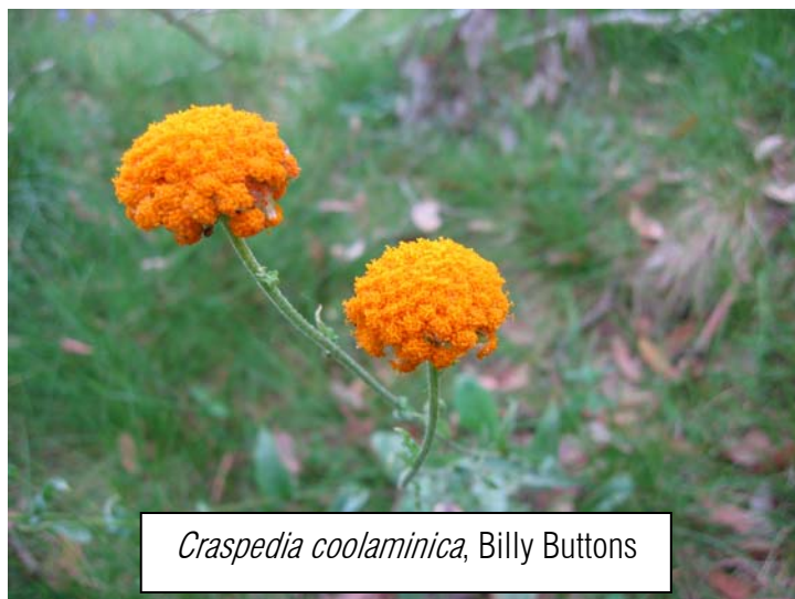
Craspedia coolaminica , Billy Buttons

In addition to protecting the alpine environment, it is important that we celebrate it for its unique beauty. To live, work or play in this environment is a privilege. We all have a responsibility to ensure our lives and activities don't impact negatively on the alpine environment. One way you can do this is by planting native flora species around your lodge.