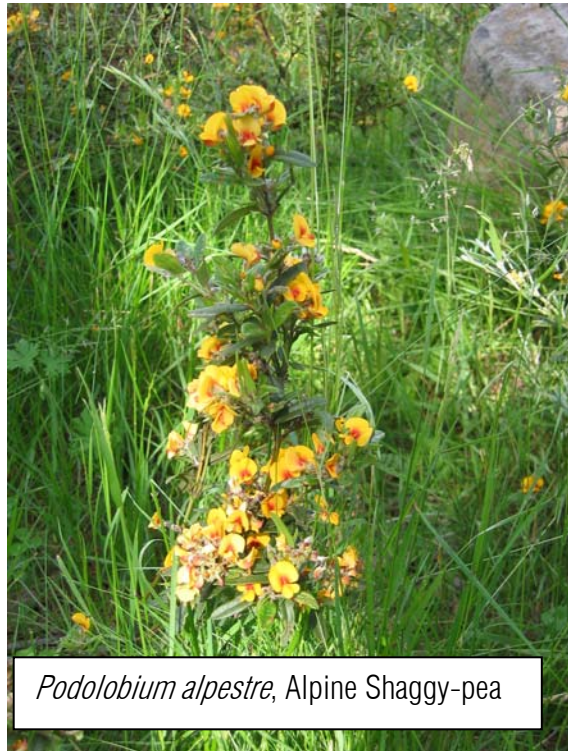
Podolobium alpestre , Alpine Shaggy-pea

The alpine zone is loosely defined as being the area above the physiological limit of tree growth. The alpine zone is subject to heavy, persistent blanketing with snow for extended periods of time. The sub-alpine zone is characterized by the presence of Snow Gums, but also experiences persistent snow throughout winter. These two zones, often referred to as 'snow-country', comprise about 11,500 square kilometres, or 0.15% of the Australian landmass.