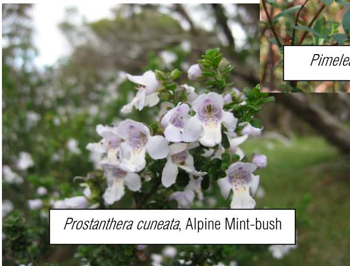
Prostanthera cuneata , Alpine Mint-bush

It recognizes that native vegetation communities provide a range of ecosystem functions that are fundamental to overall environmental health.