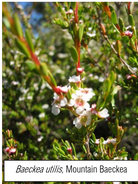
Baeckea utilis , Mountain Baeckea

This temperature gradient is reflected by distinct changes in the floral communities with increasing altitude. This is quite evident driving up to the Mt Buller village. Three of the more distinct vegetation zones are the impressive stands of Alpine Ash in the