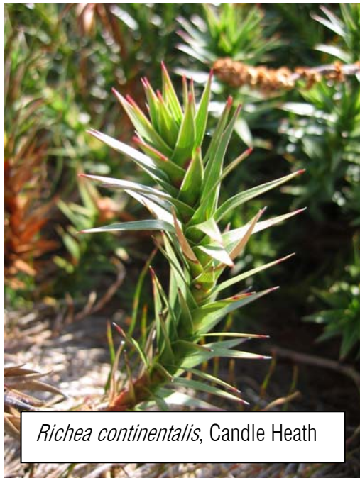
Richea continentalis , Candle Heath

The purpose of this guide is to provide developers, the general public and other interested parties information about planting and gardening in the alpine environment at Mt Buller and Mt Stirling. This guide aims to facilitate beautification of the Mt Buller village and protection and improvement of the ecological integrity of Mt Buller and Mt Stirling.