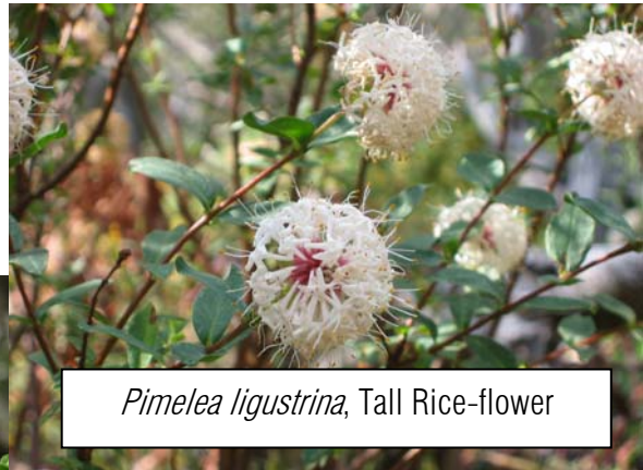
Pimelea ligustrina , Tall Rice-flower

The Mt Buller and Mt Stirling Alpine Resort Management Board’s goal “to protect and rehabilitate native flora and vegetation associations within the resort area” agrees with State and Federal government objectives to increase net vegetation cover.