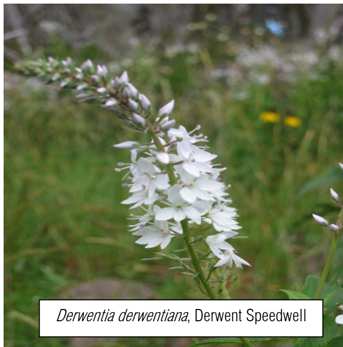
Derwentia derwentiana , Derwent Speedwell

The Mt Buller and Mt Stirling Resort Management Board is working to eliminate weeds in the Resort. For help with identification of weeds at Mt Buller or Mt Stirling, check the website www.mtbuller.com.au or contact the Alpine Resort Management Board.